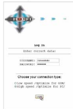
Fig. 2.1 – Log In screen for Web interface

Friendly web interface for custom convenience: