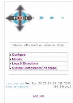
Fig. 2.2 – main menu screen for web interface

In the following part we are gone into the functionality of the system and the activities that are performed by the system in general: